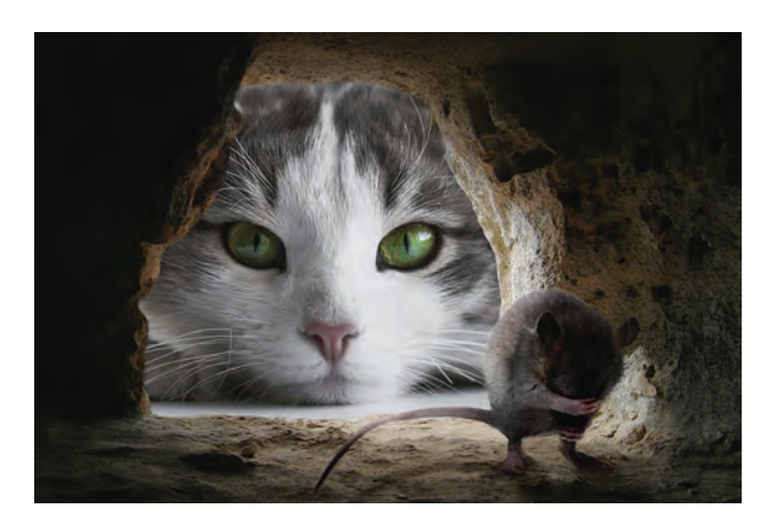
Like people, each character has their own unique perspective. Whose viewpoint will you use to tell your story?

Every story is told from a certain perspective. Who is the best character to tell your story? Sometimes the story is told as seen through the eyes of the main character, so the reader only knows what the main character sees or thinks, and sometimes an unnamed narrator tells the story from a more objective viewpoint, allowing the reader to see what every character is doing and thinking. This all comes down to point of view. Imagine, for instance, how different the story of Little Red Riding Hood would be if it were told from the point of view of the wolf.