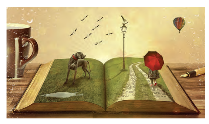
Stories help us connect with others and explore what it means to be human.

Stories have three main elements—setting, characters, and plot—and the interaction of these elements creates the story. Each element matters because each one influences how the story unfolds. These elements are familiar because they are the same elements that create our personal stories, the ones we live every day, which unfold across a landscape of places, people, and events.