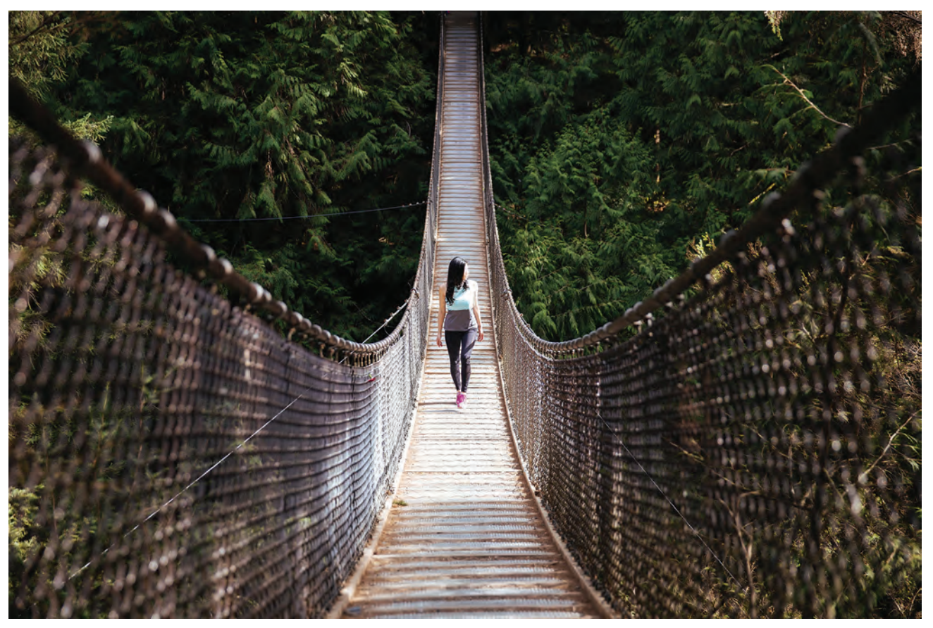
Sometimes characters have to face their fears to accomplish their goals. What will your character do?

Remember, dialogue and action in a story need to have a purpose—they need to move the story forward. If a character walks into a room, they must have a good reason for doing so; it can't just be because they need to be there for the next scene. Just as you wouldn't normally wander around your house for no reason, your characters shouldn't wander without purpose throughout your story.