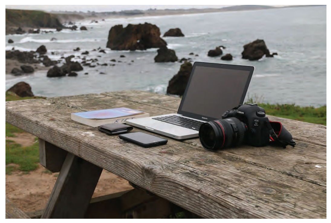
Take advantage of local resources to learn more about your topic.

You don't have to travel far to gain valuable experience. Think creatively about local places that might offer interesting perspectives to your piece. If you are doing a piece on the Westminster Kennel Club Dog Show, you may not be able to travel to New York to see it in person, but there might be a breeder or trainer nearby who can provide intriguing insight into the world of dog shows. If you are researching the Antarctic, there may be local scientists who are involved in related research, or a pier or an aquarium nearby where you can observe marine animals at close range. Talk to the people you meet in your travels about your project and ask about their work. You never know where it might lead.