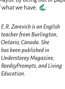
teacher from Burlington, Ontario, Canada. She has been published in Understorey Magazine, ReedsyPrompts, and Living