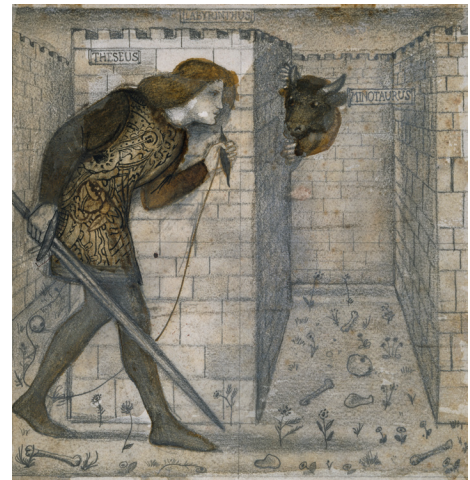
Theseus and the Minotaur in the Labyrinth by Edward Burne-Jones, 1861

As you can see, the story of Theseus clearly shows many of the elements of the hero's journey. Theseus is both god and man and is of royal blood. The labyrinth is the underworld, a dark unknown realm of danger and reward. Ariadne represents his supernatural aid, helping him with special tools that allow him to overcome the obstacles of the labyrinth. And the all-powerful Minotaur is his final confrontation. The half-man, half-god hero meets the half-man, half-beast enemy and defeats him, thus coming into his own as hero and conqueror. Then he makes his return journey out of the labyrinth and back into the world of light with the assistance of his supernatural aid.