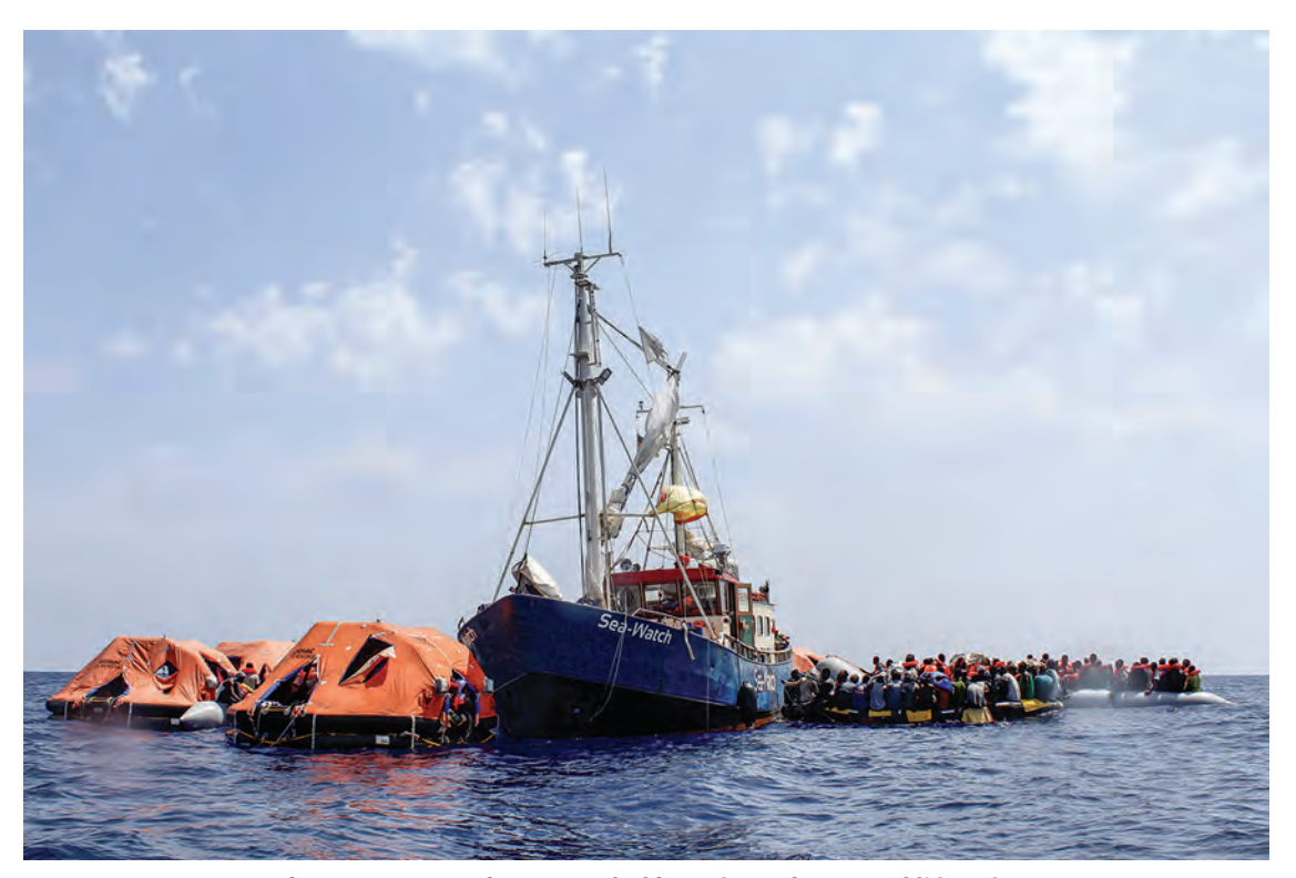
The MV Sea-Watch surrounded by refugee boats and life rafts waiting for assistance on July 5, 2015.