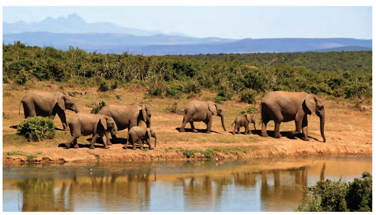
Elephant family, South Africa

Statement from a Bushman who had been sentenced to hard labor for stealing a sheep, circa 1870, from A Story Like the Wind