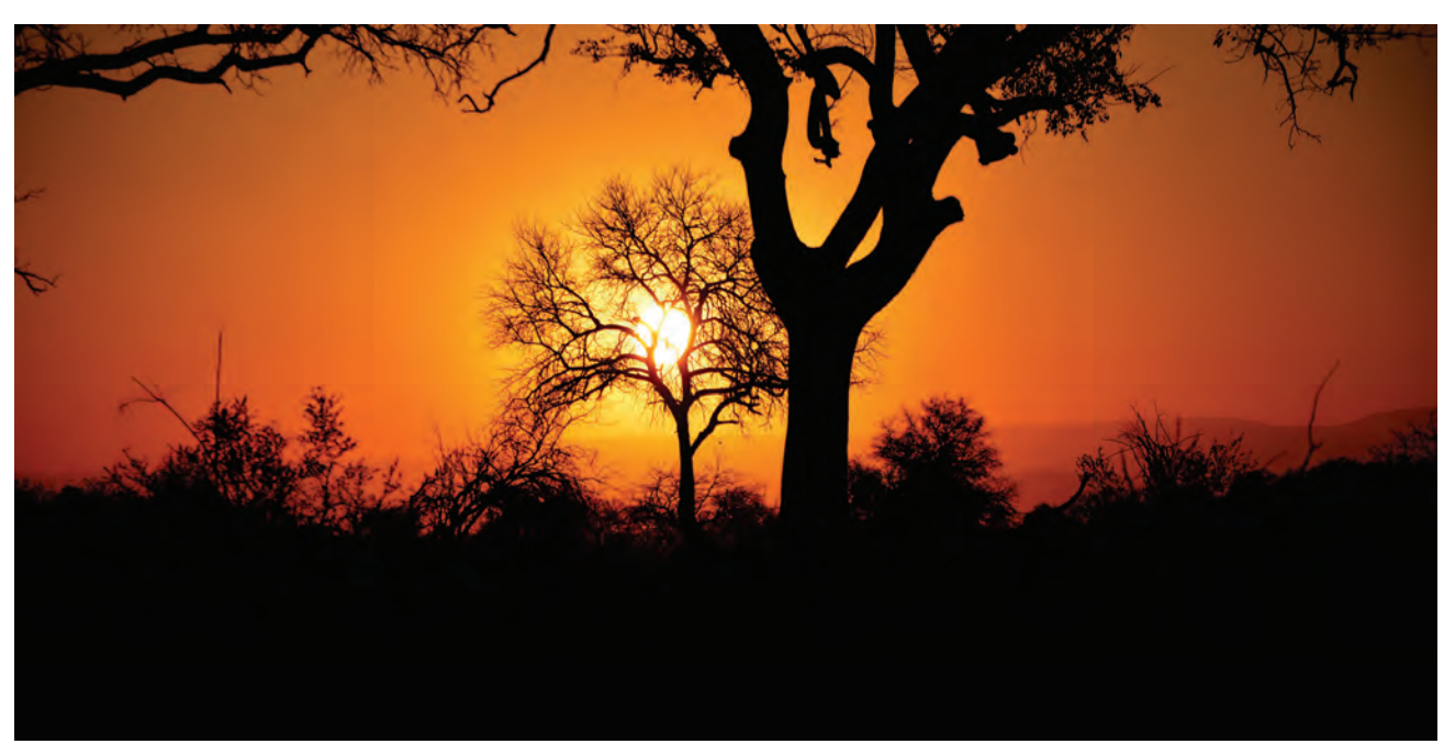
Sunset at Kruger National Park, South Africa

Laurens van der Post, A Story Like the Wind