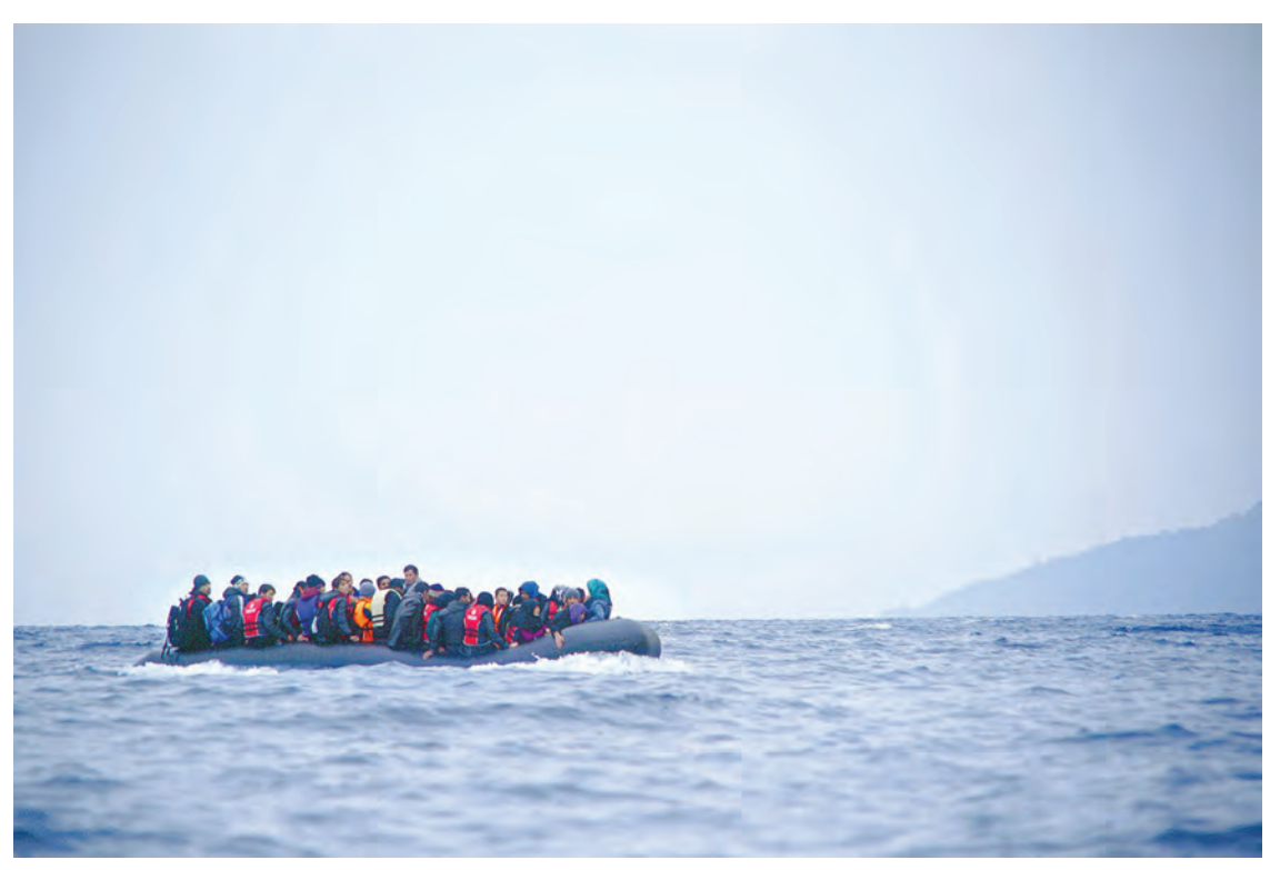
Refugees on a boat crossing the Mediterranean Sea, heading from the Turkish coast to the northeastern Greek island of Lesbos, 2016.