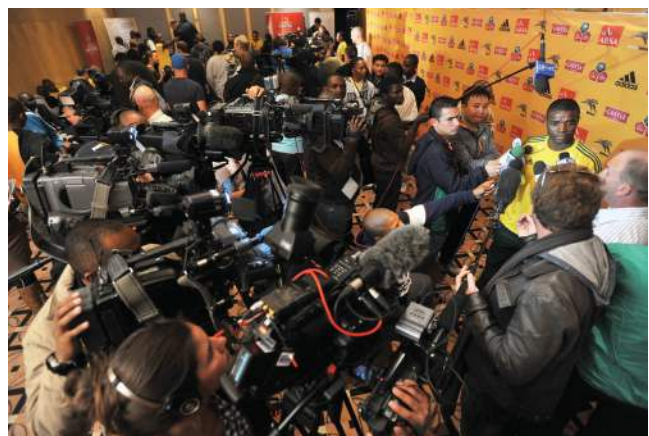
What is the role of news media in government?

Throughout your study of U.S. government, you will be asking many questions and doing research to gain perspective and information. In this lesson, you will be writing and thinking about bias and research. You may have heard it before, but it is always worth remembering: be careful about what you read and believe.