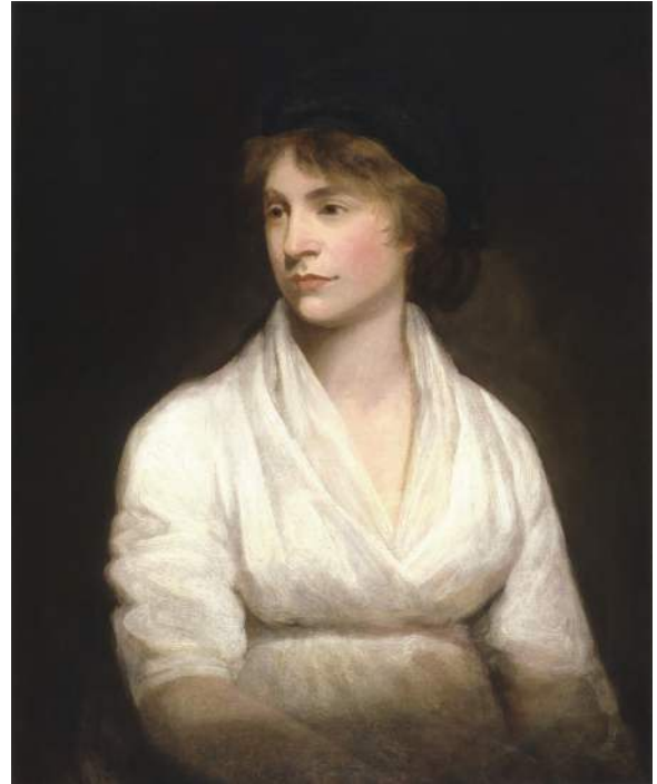
Mary Wollstonecraft by John Opie, circa 1797

Mary Wollstonecraft was an outspoken advocate of women’s rights and sought educational reform in England that would allow girls to be educated the same as boys. She believed that better education would open opportunities for women to be more productive members of society. Wollstonecraft felt the educational system should be changed through political action at the national level, which would be beneficial for everyone, not just women. Her work inspired later women’s rights advocates in Europe and America.