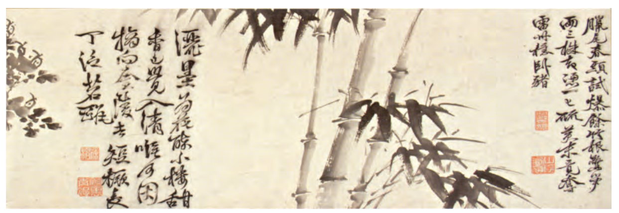
Twelve Plants and Calligraphy, Xu Wei, 16th century, Ming Dynasty

This section provides another idea for how to explore the material. These sections are designed for students who are particularly interested in a topic or who are looking for an additional way to challenge themselves and develop their knowledge and skills. All "Up for a Challenge?" sections are optional.