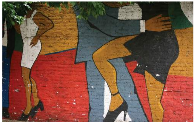
Tango painting on a wall in Buenos Aires

Spend time on the creative aspects of your project, finding ways to interact with the material and present it visually in a manner that is engaging. Look for ways to bring all three elements together in an effective way.