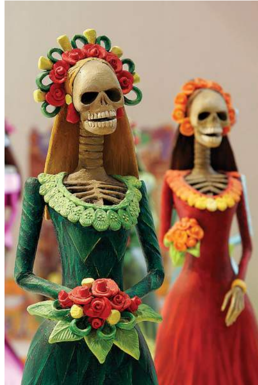
Day of the Dead celebrations honor the memories of loved ones who have died.

Depending on where you are in your studies and when you started this course, Día de los Muertos (Day of the Dead) may be near. This holiday is enjoyed in many countries in Central and South America on November 1 and 2. Día de los Muertos celebrates and remembers loved ones who have died, oftentimes by cooking their favorite food and creating offerings in their honor.