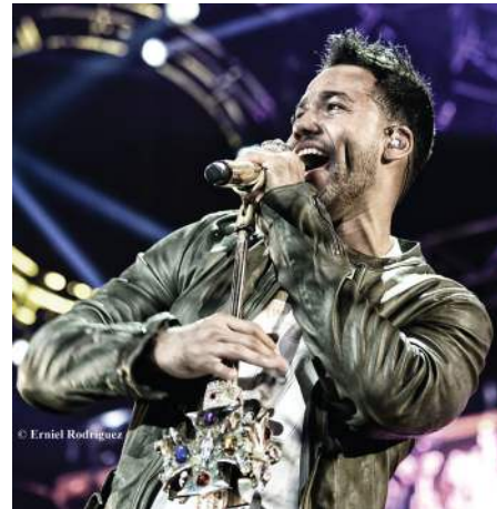
Romeo Santos