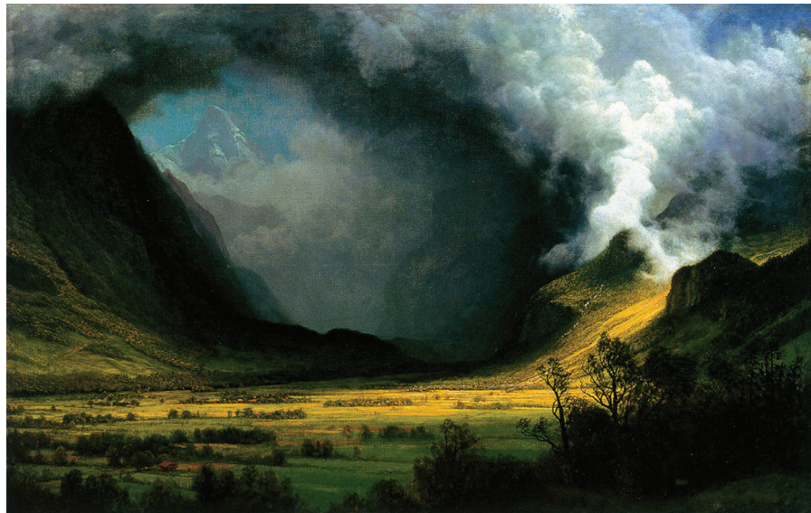
Storm in the Mountains by Albert Bierstadt, 1870

By reading and reflecting on the authentic experiences of those who lived in the United States of America then, you will come closer to understanding how a country is formed and how the land influences its people.