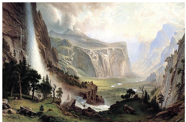
The Domes of Yosemite by Albert Bierstadt, 1867