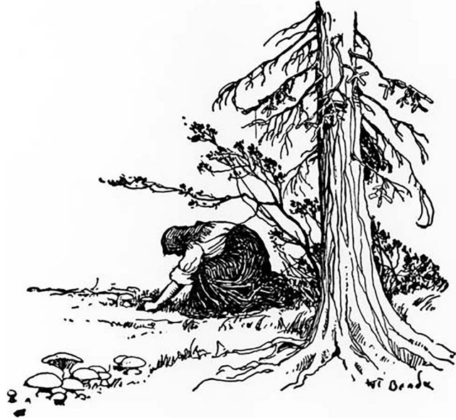
Bohemian woman gathering mushrooms, woodcut by W. T. Benda, 1918

what she sees: “blue sky, blue eyes” (19). Likewise, Ántonia’s father is eager for her to learn English. He recognizes language acquisition as essential to their success in the new land. As Ántonia and Jim’s friendship solidifies, they learn about themselves, each other, and the land that is now their new home.