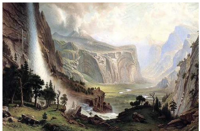
The Domes of Yosemite by Albert Bierstadt, 1867