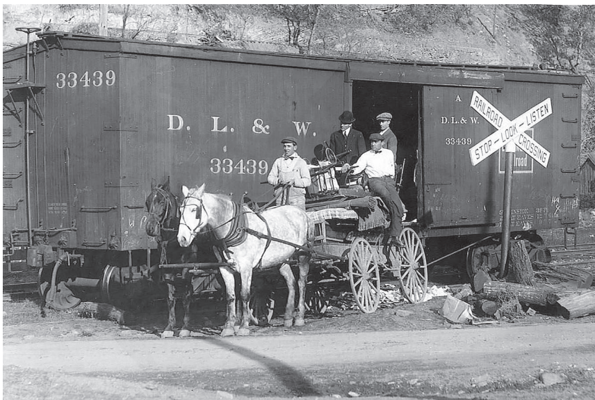
Travel by train and horse-drawn wagon was common in the 19th century.