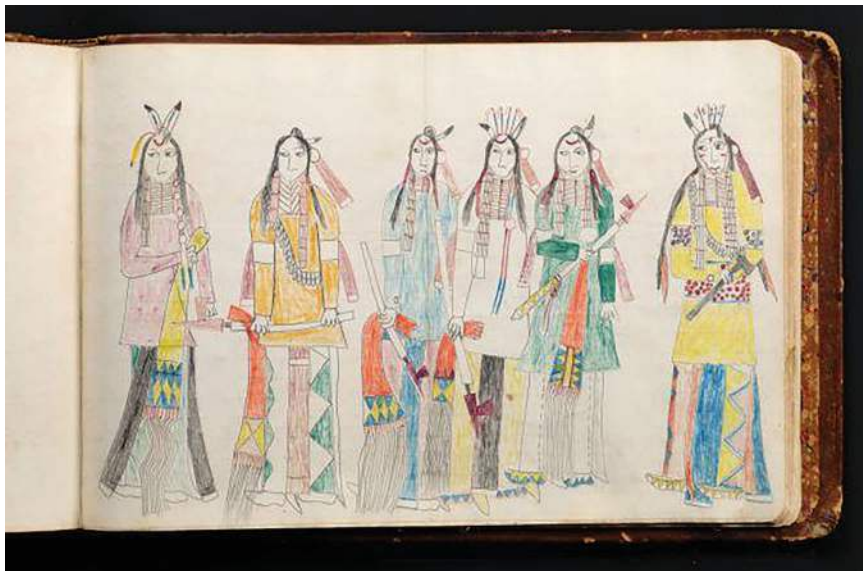
Untitled work by Lakota leader Black Hawk, ca. 1880