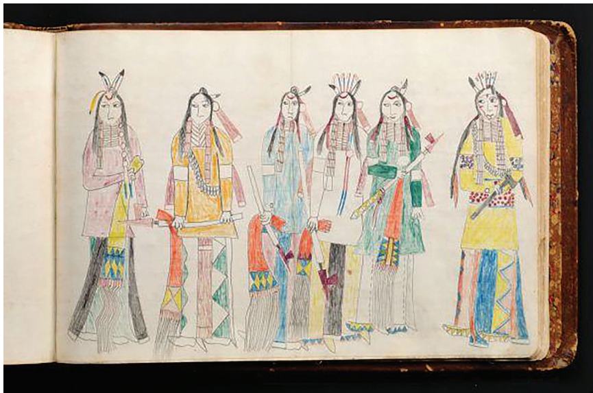
Untitled work by Lakota leader Black Hawk, ca. 1880