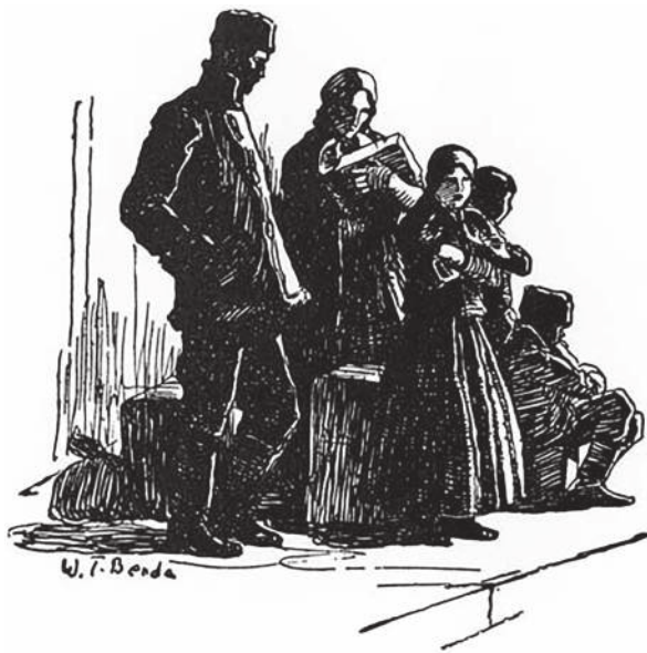
Group portrait of the Shimerda family, woodcut by W. T. Benda, 1918