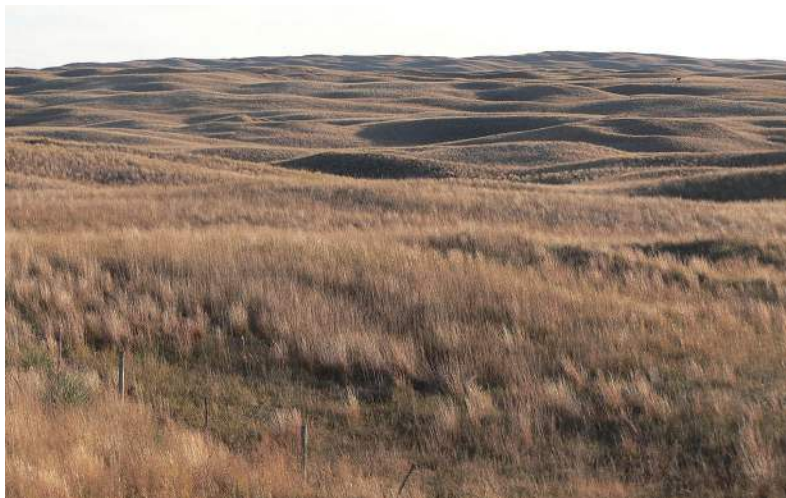
Nebraska Sandhills

As you become more aware of the sense of place in the literature you read, consider your sense of place in your own life.