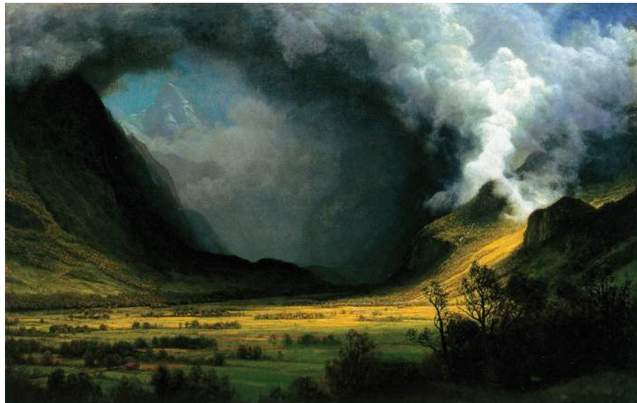
Storm in the Mountains by Albert Bierstadt, 1870

By reading and reflecting on the authentic experiences of those who lived in the United States of America then, you will come closer to understanding how a country is formed and how the land influences its people.