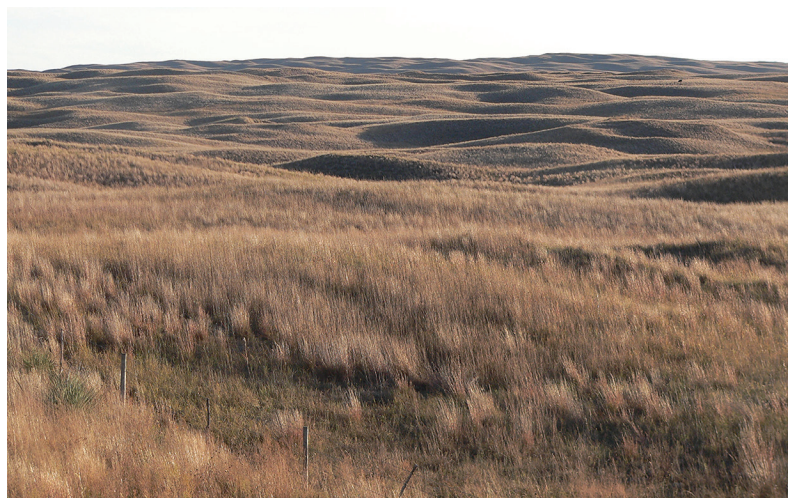
Nebraska Sandhills

As you become more aware of the sense of place in the literature you read, consider your sense of place in your own life.