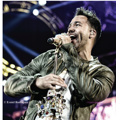
Romeo Santos