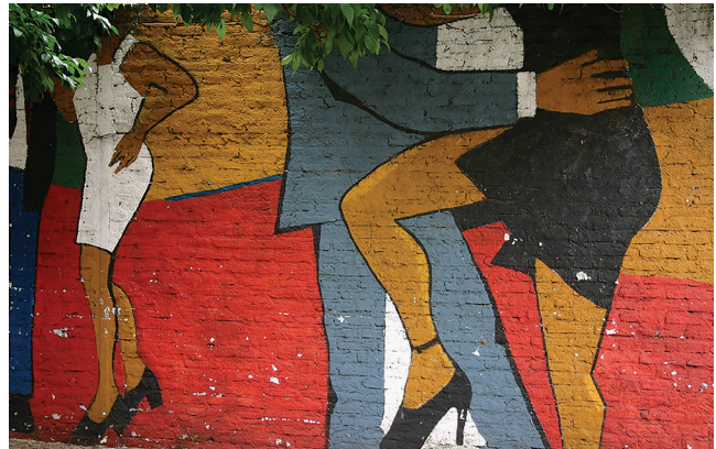
Tango painting on a wall in Buenos Aires

Spend time on the creative aspects of your project, finding ways to interact with the material and present it visually in a manner that is engaging. Look for ways to bring all three elements together in an effective way.