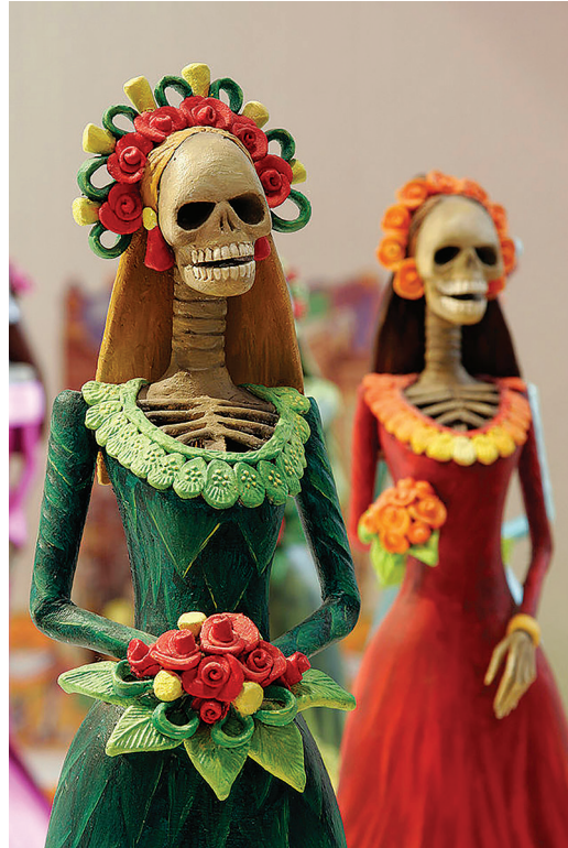
Day of the Dead celebrations honor the memories of loved ones who have died.

Depending on where you are in your studies and when you started this course, Día de los Muertos (Day of the Dead) may be near. This holiday is enjoyed in many countries in Central and South America on November 1 and 2. Día de los Muertos celebrates and remembers loved ones who have died, oftentimes by cooking their favorite food and creating offerings in their honor.