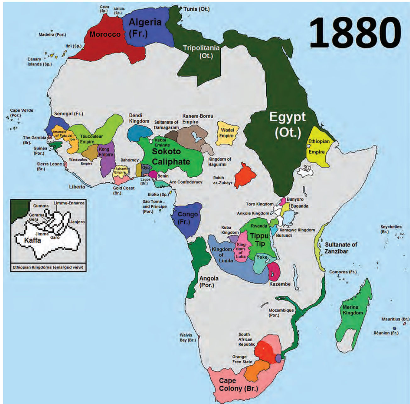
Map showing how the “Scramble for Africa” was experienced across the continent

Of course, the success of the European Triad was often devastating for non-Europeans. In the United States, Indigenous groups were dispossessed and massacred in the name of American “ Manifest Destiny .” The developing nation-states of the Western Hemisphere (most notably the United States, Canada, and Brazil) were racially exclusive; in this period, full membership in the nation (and thus, full political rights in the state) were dependent on European ancestry.