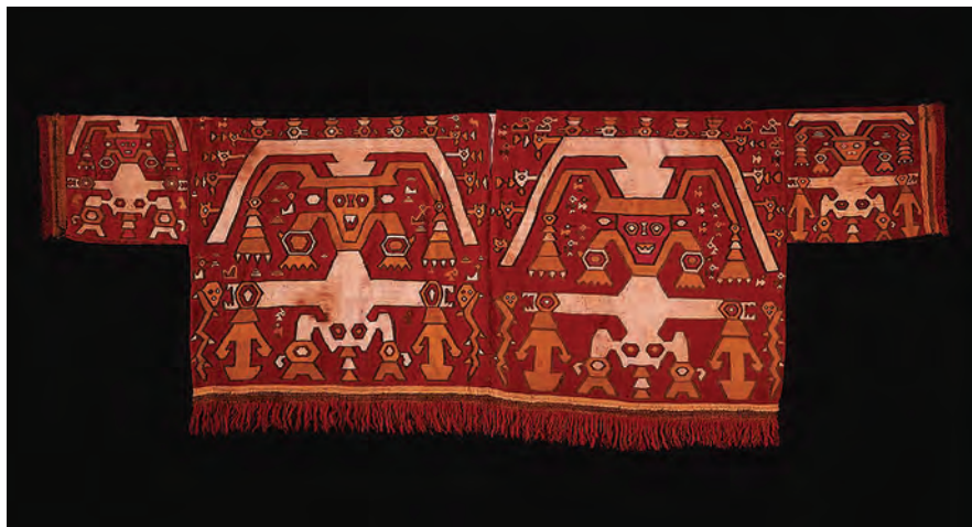
Chimú tapestry shirt, c. 1400–1540 Peru

Despite these obstacles, a diverse range of complex and successful societies flourished in North, Central, and South America, and several regions were home to widespread and prosperous “common cultures,” such as the Chavín in the Andes Mountains and the Olmec and Maya in what is now Mexico. These cultures developed intricate religions, impressive cities, and complex trade connections with their neighbors. Over time, some particularly successful rulers even unified substantial territories under their authority. Though smaller and shorter-lived than Rome, China, or the Islamic caliphate, the Chimú and Tiahuanaco empires in the Andes, the Teotihuacán and Toltec empires in Mexico, and the traders of Cahokia along the Mississippi River were sophisticated political and economic powers.