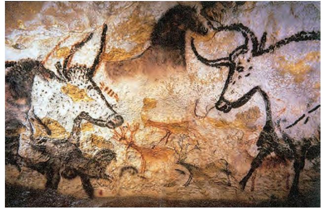
A painting of aurochs, horses, and deer, estimated to be around 17,000 years old, from the Lascaux caves in southwestern France

animals rather than gathering plants and hunting animals in the wild. It first appeared in the region known as the Fertile Crescent (around modern Iraq), and independently developed at later dates in several regions of the Americas, Africa, and East Asia. Farming crops and herding animals (a practice known as pastoralism ) made much more food available, leading to dramatic population growth. In addition, the need to tend crops from planting to harvest required humans to settle in one place, rather than move around in search of food. Permanent villages and cities sprung up on the most fertile farmland.