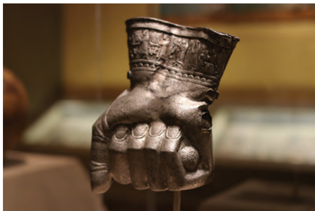
Drinking cup in the shape of a fist from the Hittite Kingdom, central Turkey

surrounding countryside under one rule. The largest and most powerful of these states were the Kingdom of Egypt , the Amorite Kingdom of Babylonia , and the Hittite Kingdom in Anatolia (modern Turkey). These kingdoms jockeyed for domination over dozens of smaller surrounding states.