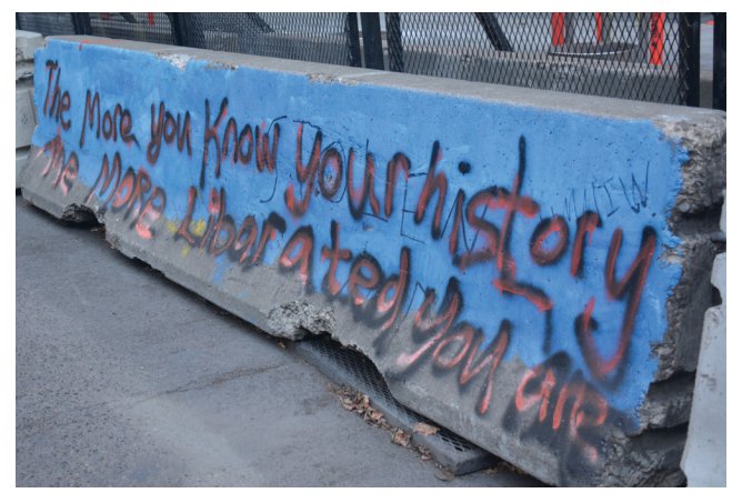
Graffiti inspired by racial justice protests in Portland, Oregon, August, 2020: "The more you know your history, the more liberated you are."

It seems like there would be a wide gulf between civil dissent and revolutionary tactics, or between revolutionary ideas and an oppres-