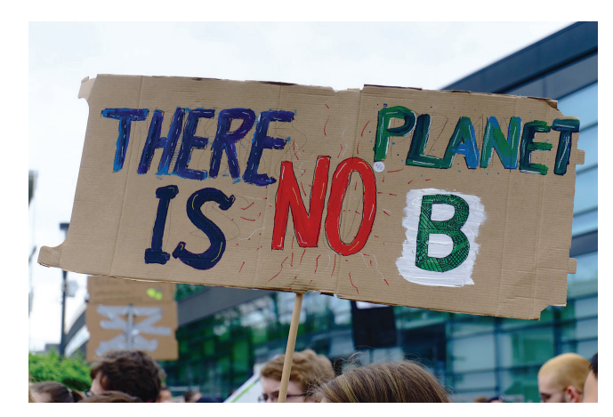
Student protests brought greater awareness to the urgency of the climate change crisis.

For instance, on January 21, 2017 (the day after President Donald Trump was sworn into office), hundreds of thousands of people gathered in Washington, DC, while millions assembled in smaller gatherings across the country and around the world to protest sexual harassment and to support women's rights. In 2019, students across the United States staged regular school walkouts to protest the government's inability to make meaningful progress toward halting and reversing climate change. In 2020, mass protests—mostly peaceful, but some violent—played out around the world in support of racial justice as citizens demanded