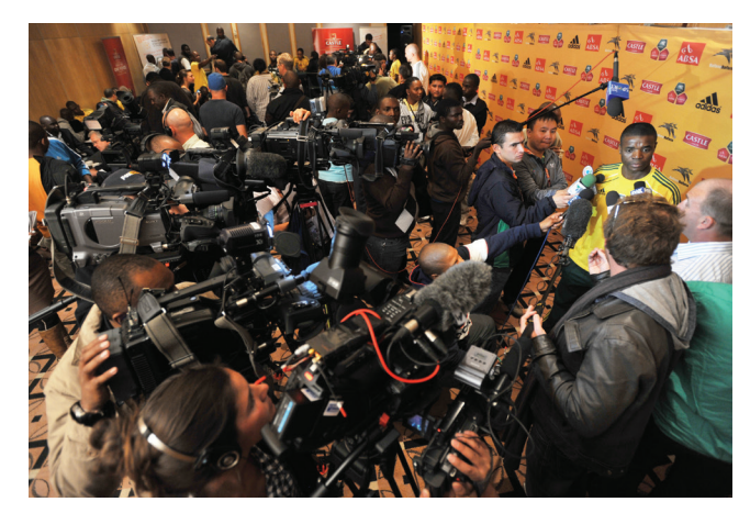
What is the role of news media in government?

Throughout your study of U.S. government, you will be asking many questions and doing research to gain perspective and information. In this lesson, you will be writing and thinking about bias and research. You may have heard it before, but it is always worth remembering: be careful about what you read and believe.