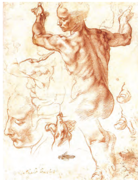
Michelangelo sketched hundreds of poses as he studied the intricate form and motion of the human body. (Image credit: Metropolitan Museum of Art)

Do the math, and you end up with the staggering number: 37 \times 1,021 chemical reactions went on in your cells in the time it took you to read that short sentence. That's at least 37,000,000,000,000,000,000,000 reactions . . . in one second. That's just the beginning of what is going on in your body.